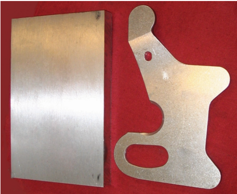
Before and after—using VoluMill™, DMW now rough mills two of these parts in the time it used to take to rough one.

Using VoluMill toolpaths, DMW has increased speeds and feeds and decreased cycle times and programming time for rough machining complex aluminum, stainless steel, and titanium aerospace and defense parts. The software has also given the aerospace-oriented job shop greater flexibility with respect to how machines are utilized.